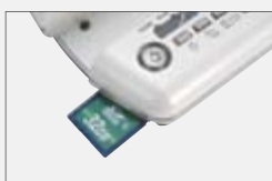
SD Card Slot

Still images can be stored on an SD card.