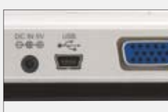
Powered via USB

High definition image presentation possible.